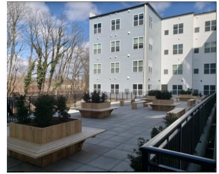
The Station at Grant

On Plainfield's South Avenue. The Centurion Plainfield is one of a few ongoing projects, and nearby, a Wawa will be completed by Thanksgiving.