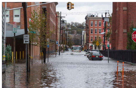
Flooding in Hoboken

The extreme weather we saw across New Jersey and the globe this summer alone has made New Jersey's need for climate and flood resilience solutions all the more clear: These risks will only worsen in the years to come. We must act now to safeguard New Jersey's 9.4 million residents, our communities, our environment and our economy.