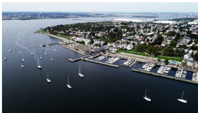
Perth Amboy Waterfront

Today, we have one more tool in our kit: a Statewide Climate Change Resilience Strategy that will help us down the path to a stronger, fairer and more resilient New Jersey.